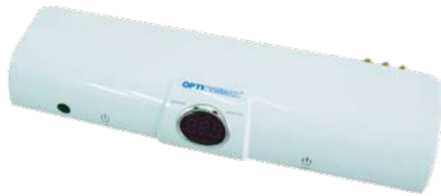
* AV Mate Junior